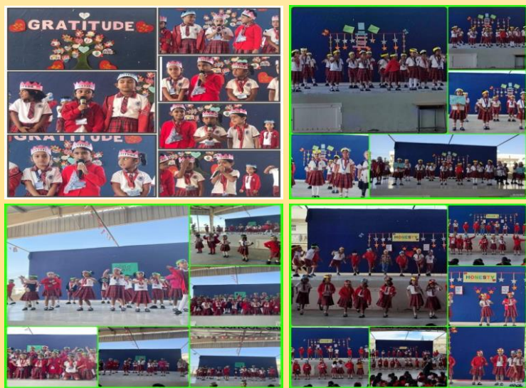
'Great values are built on strong moral foundations.'

Value-based education aims at training the students to face the outer world with the right attitude and values. It is a process of overall personality development of a student. It includes character development, personality development, citizenship development, and spiritual development.