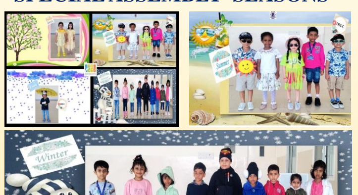
'Seasons are nature's way of showing us how to live'

Children understand the passage of time and change when they learn about seasons. Kindergarten conducted a special assembly on 18th January 2023. Children dressed up according to different seasons and spoke about the same.